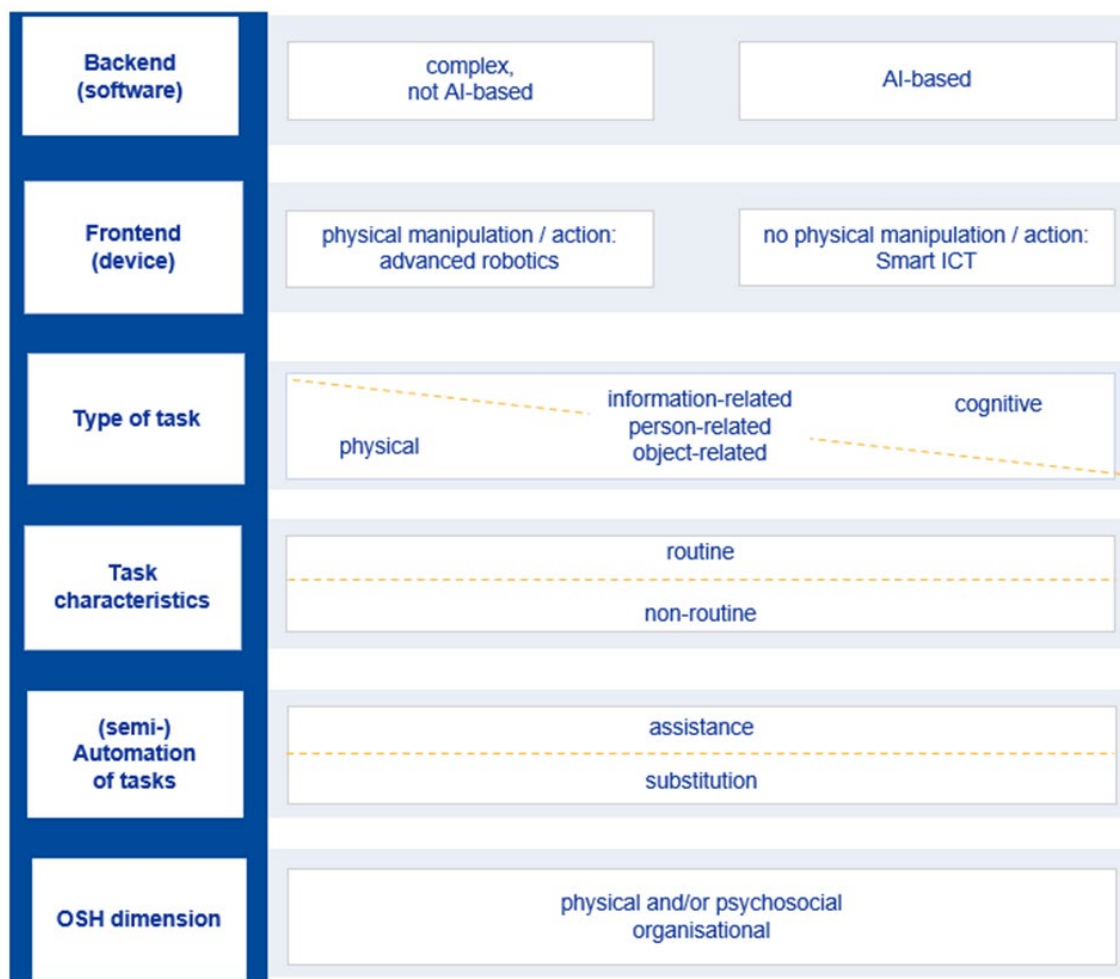
Figure 2. Taxonomy for AI-based systems and advanced robotics for the automation of tasks

The system performs cognitive tasks based on an AI-backend software . It assists the clinicians in their task of performing a colonoscopy for cancer screening. It also assists in an information-related task that requires continuous concentration from the medical practitioner.